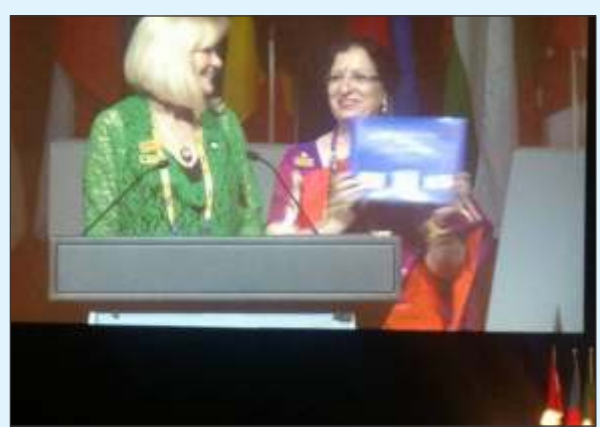
Book compiled on Poems on IIWP Theme – Leave a Lasting Legacy was handed over to IIWP as a sweet gesture of remembrance