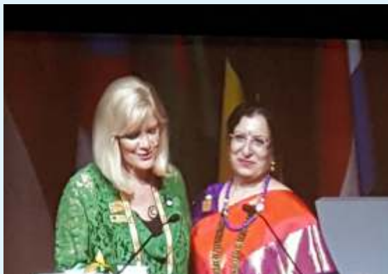
Convention Coordinator Presented her closing Address