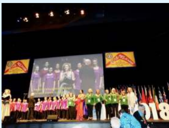
Musical choir by Australian Girls Choir